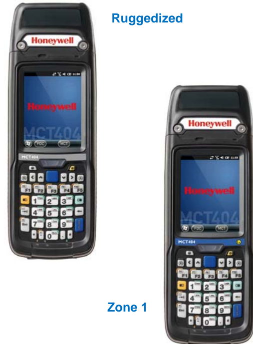
Figure 1 MCT404 Selectable versions (Ruggedized and Zone 1 Intrinsically safe)