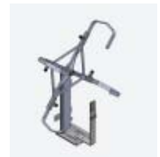
Support & Mounting Plate