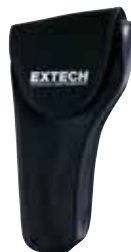
Optional CA986 carrying case for 42540