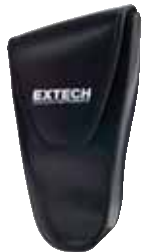
Optional CA980 carrying case for 42510