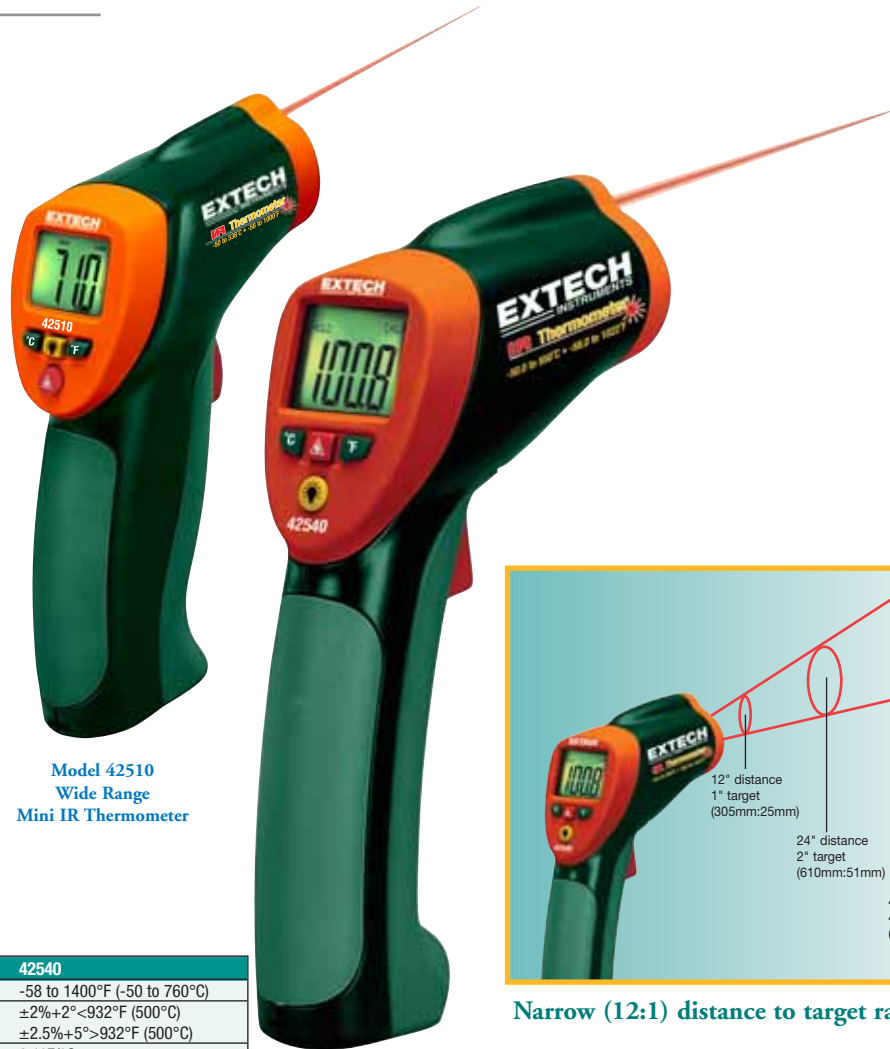
Model 42510 Wide Range Mini IR Thermometer