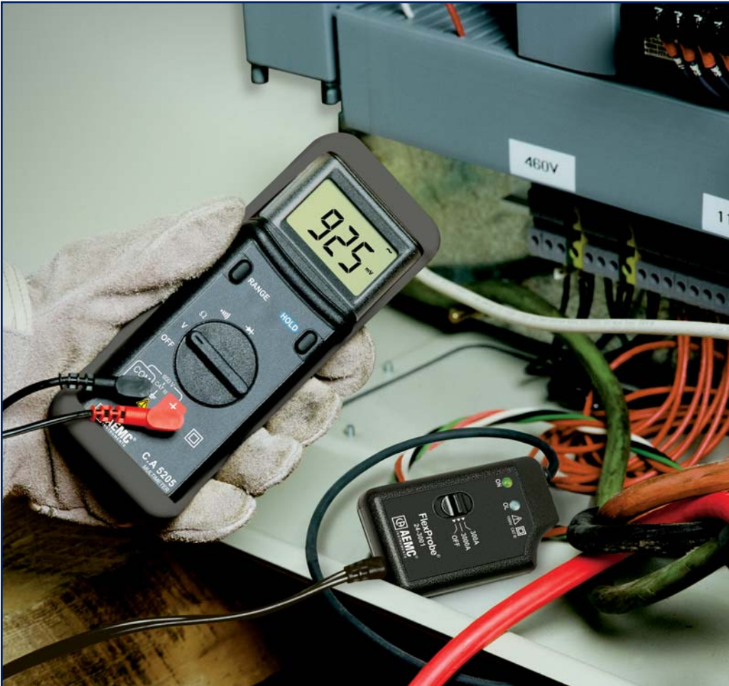
FlexProbe® conveniently plugs into the standard DMM voltage input for direct read-out of the measured current.