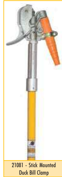
21081 - Stick Mounted Duck Bill Clamp