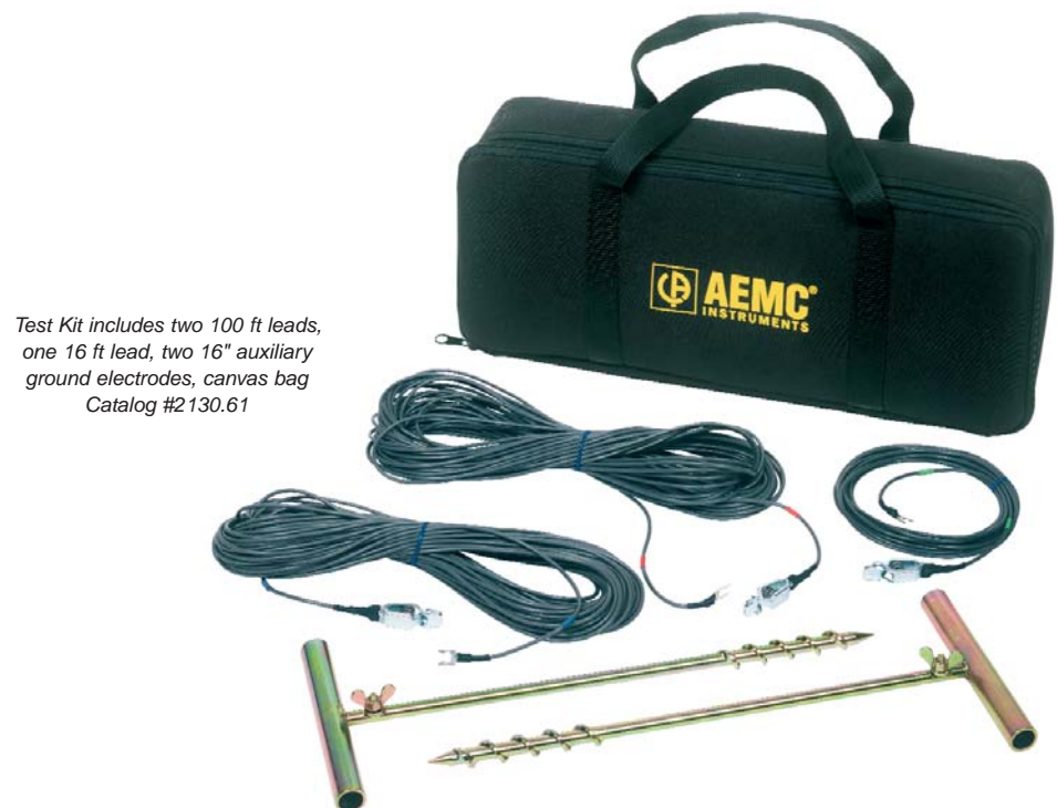
Test Kit includes two 100 ft leads, one 16 ft lead, two 16" auxiliary ground electrodes, canvas bag Catalog #2130.61