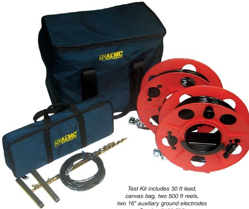
Test Kit includes 30 ft lead, canvas bag, two 500 ft reels, two 16" auxiliary ground electrodes Catalog #100.525