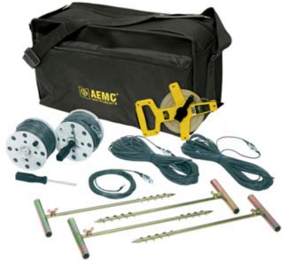
Test Kit – 4-Point includes carrying bag, two 300 ft color-coded leads on spools, two 100 ft color-coded leads, four 16" auxiliary ground electrodes, one 16 ft lead with Mueller® clip and one 100 ft tape measure Catalog #2130.63