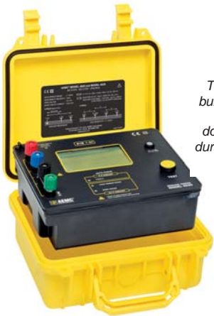
The Models 4620 and 4630 are built into a double case. This extra rugged construction provides double insulation, maximum field durability and ease of serviceability.