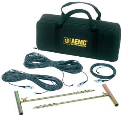
Ground Test Kit – 3-Point (supplemental 4-Point) includes carrying bag, two 100 ft color-coded leads, one 16 ft lead and two 16" auxiliary ground electrodes Catalog #2130.61