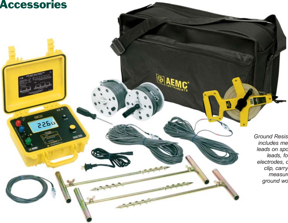
Ground Resistance Tester Model 4630 Kit includes meter, two 300 ft color-coded leads on spools, two 100 ft color-coded leads, four 16" auxiliary ground electrodes, one 16 ft lead with Mueller® clip, carrying bag, one 100 ft tape measure, one AC power cord, ground workbook and user manual