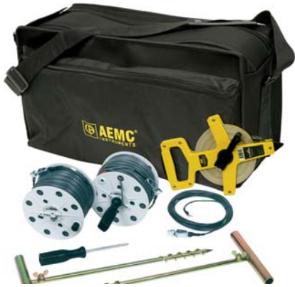
Test Kit – 3-Point includes carrying bag, two 150 ft color-coded leads on spools, two 16" auxiliary ground electrodes, one 16 ft lead with Mueller® clip and one 100 ft tape measure Catalog #2130.62