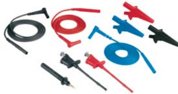
Test Leads for Model 1035 Catalog #2119.41