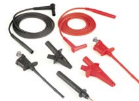
Test Leads for Model 1039 Catalog #2119.40