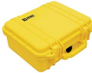
Field Case for use with all models Catalog #2118.98