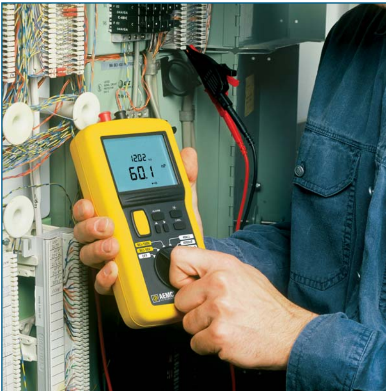
Safety rated 1000V clips provide quick and easy connection of test points for the Model 1039.