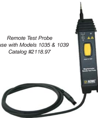
Remote Test Probe for use with Models 1035 & 1039 Catalog #2118.97