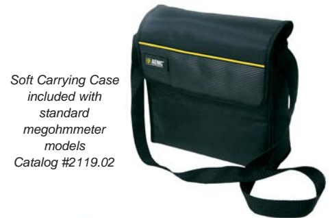
Soft Carrying Case included with standard megohmmeter models Catalog #2119.02