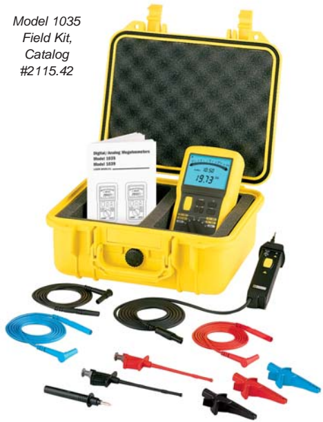
Model 1035 Field Kit, Catalog #2115.42