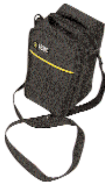
Hands-Free Carrying Case for use with all models Catalog #2118.99