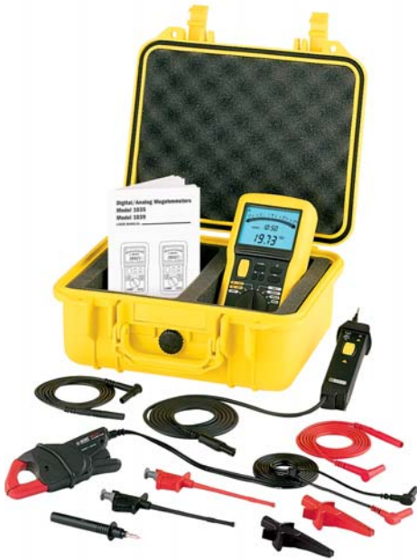
Model 1039 Field Kit, Catalog #2115.43